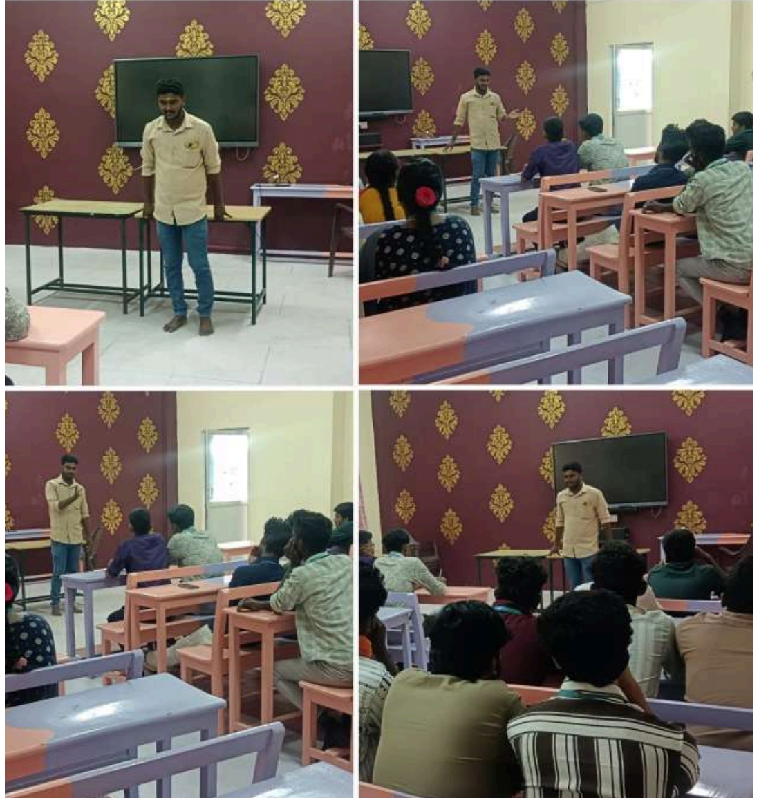
Guest Lecture on 'What Industry Look for in Freshers'