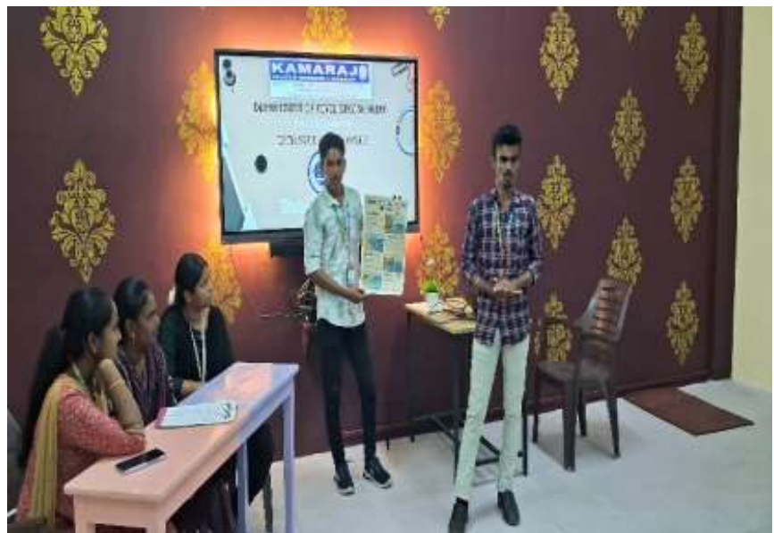
Poster Presentation "Geomorphic Agents"