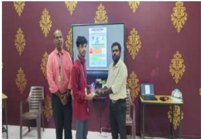
Guest Lecture on 'Civil Engineering 2030'