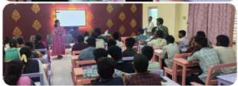
Guest Lecture on 'Pathways to Success: Competitive Exams and Career Planning'