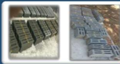
COCO Coir and light weight sand in production of light weight hollow block