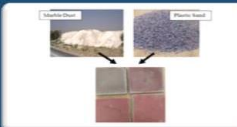
Cement Based Tiles with Plastic and Marble dust