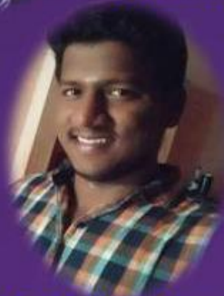
Er.G.Sivasubramani III Constructions & Consultants Sivakasi