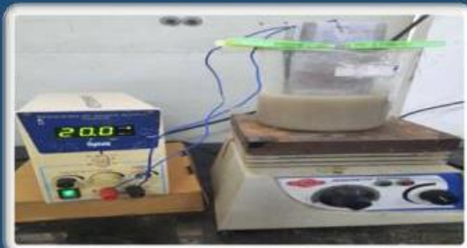
Removal of fluoride from water by electrocoagulation process