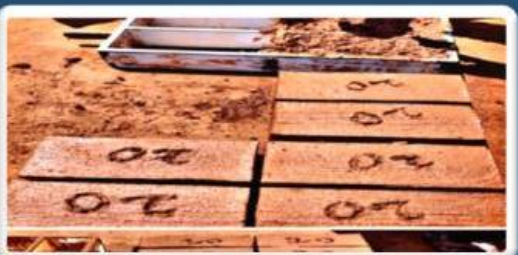
Light weight brick using vermiculite