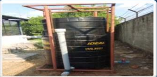
Utilization of Food Waste for the production of Energy