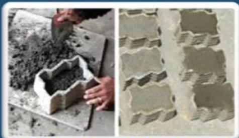
Concrete Paver block by partial replacement of Cement with Flyash and PROPOSIS JULIFLORA ASH

Its not about ideas. Its about making Ideas happen