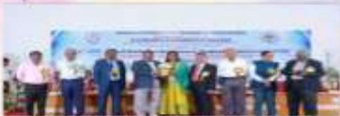
ACADEMIC ACHIEVEMENT AWARDS FOR THE BEST STUDENT AWARD FROM NEELGIRI COLLEGE OF ENGINEERING.