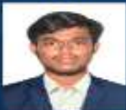
PRASHIN CHANDRU @