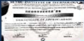
WETHU INSTITUTE OF TECHNOLOGY, A WOMEN-OWNED ENTERPRISE, HAS BEEN AWARDED THE 'BEST COMPANY' AWARD BY WETHU INSTITUTE OF TECHNOLOGY, BANGALORE.